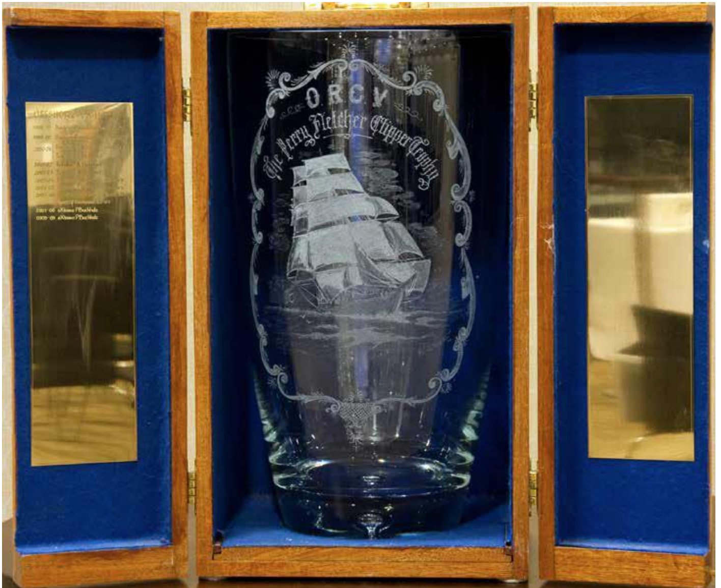
The Perry Fletcher Clipper Trophy