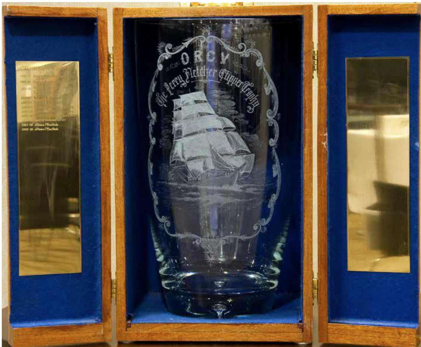
The Perry Fletcher Clipper Trophy